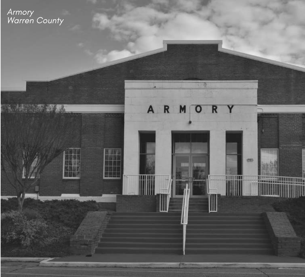
Armory Warren County

Council of Governments NOVEMBER 2021 NEWSLETTER