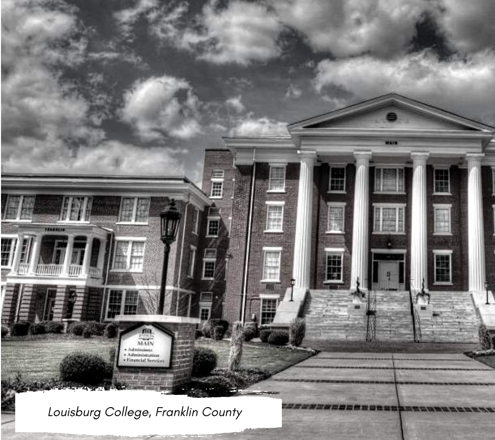
Louisburg College, Franklin County

Council of Governments MAY 2022 NEWSLETTER