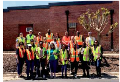
Granville County Volunteers