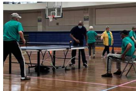
Person Co. Sr. Games participants playing Table Tennis

Senior Games continue in May with Cornhole, Bocce, and Swimming still to come. SilverArts exhibits and lively performances will be held at the Warren County Armory on May 26 followed by the Awards Ceremony. There has been extraordinary sports talent among the participants this year and it's been so much fun for everyone being together for the Senior Games after two years apart. For a schedule of this year's events, click HERE .