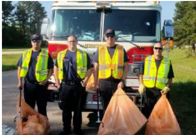
City of Henderson Fire Department

Litter Sweep is the North Carolina Department of Transportation's biannual statewide roadside litter removal initiative. Local governments, residents, and nonprofit/civic organizations throughout the state participate in local efforts to help clean up North Carolina's roadways. We thank many of our member governments for participating in litter sweep and doing their part to keep the Kerr-Tar region clean and beautiful!