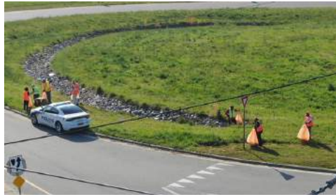
Henderson Employees Along Hwy 39